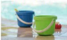
FILL THE BUCKET RELAY