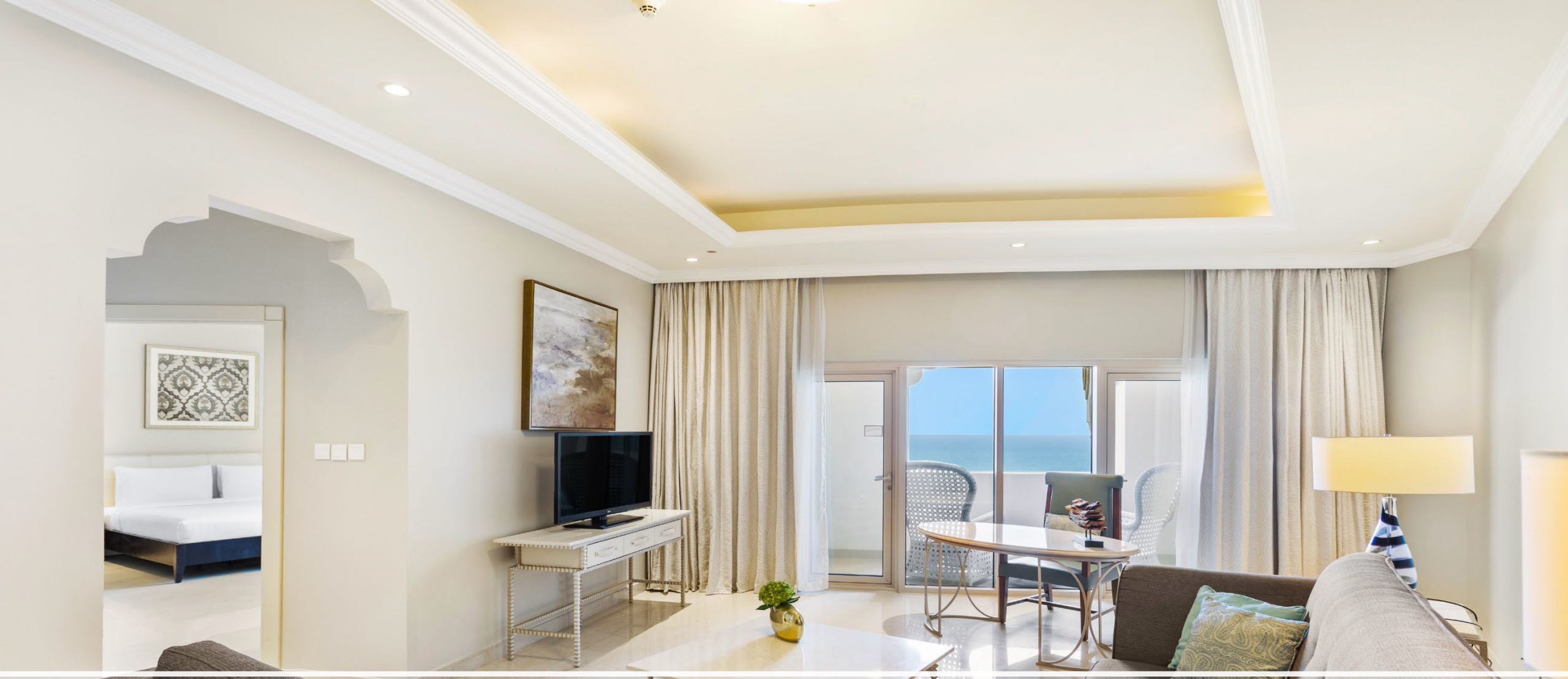
One Bedroom Residence – Living Room