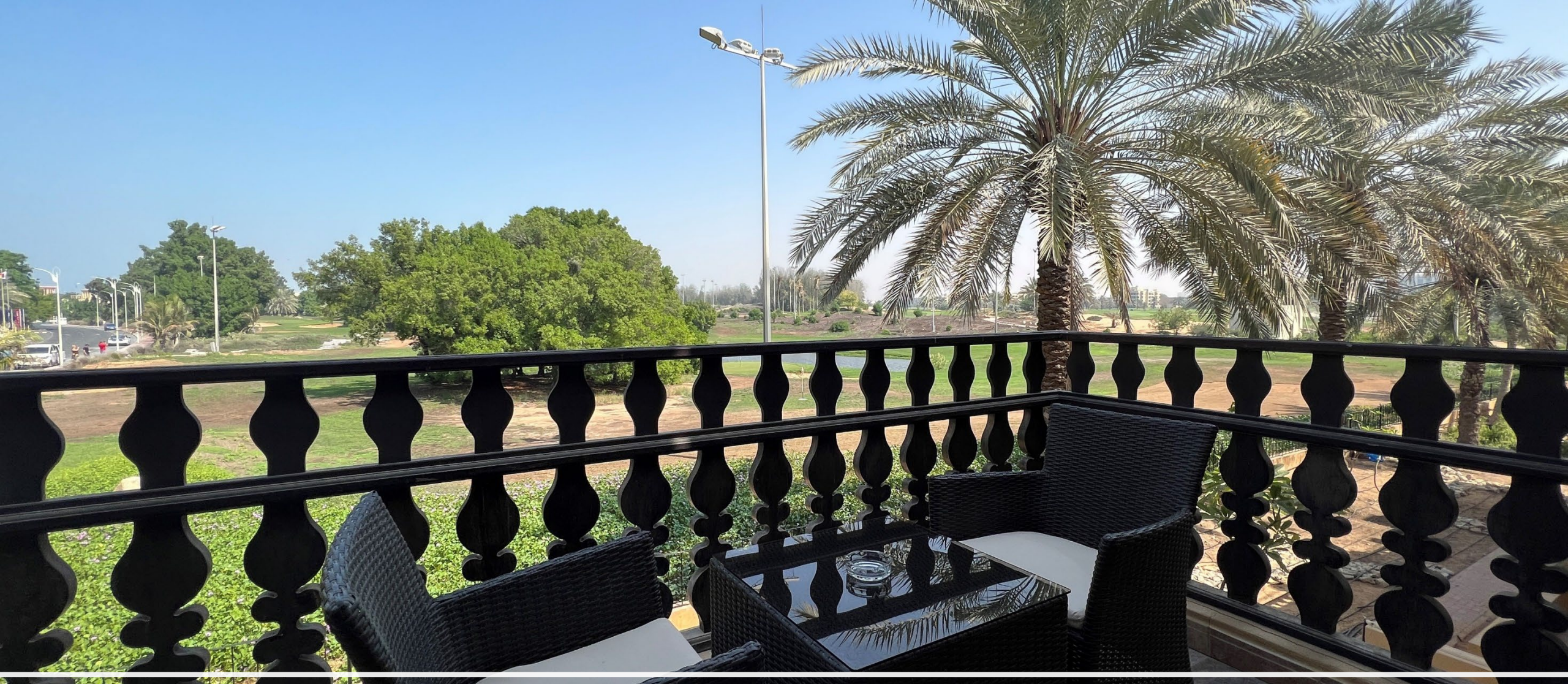
Classic Room with the Balcony